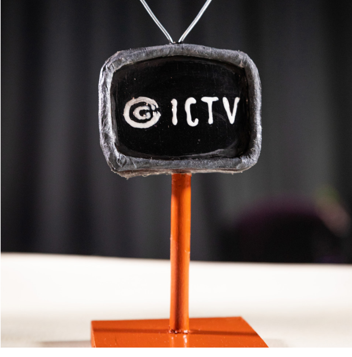
ICTV Video Awards, 2022